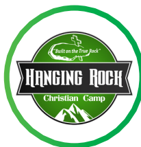
Various Supporting Churches Worship